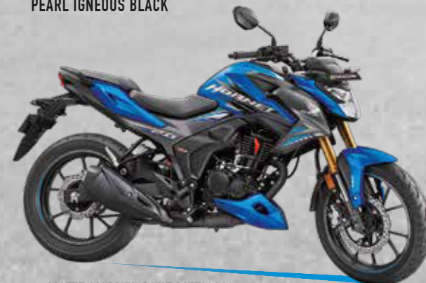
MATTE MARVEL BLUE METALLIC