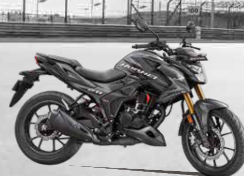
MATTE AXIS GREY METALLIC