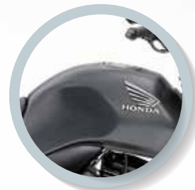
Matt. Axis Grey Metallic