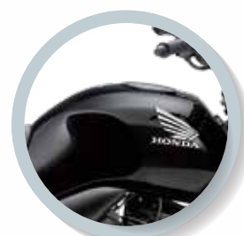
Pearl Igneous Black